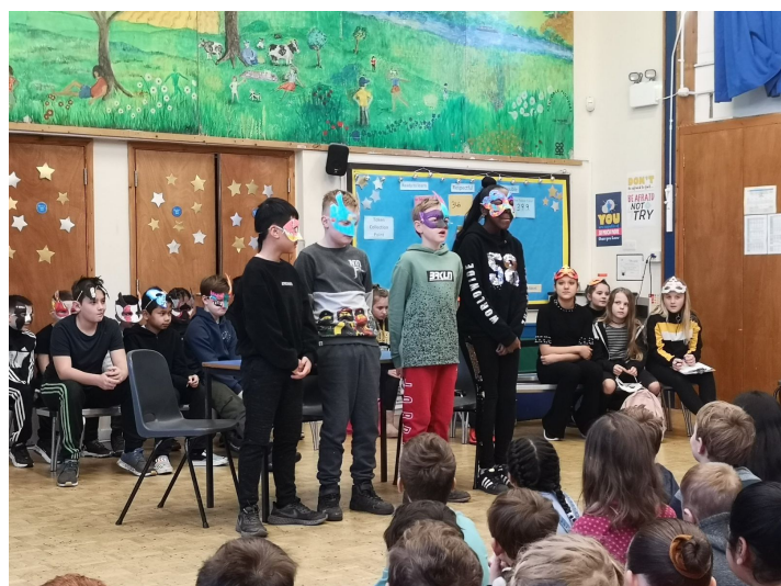
Cranes Class Assembly inspired by the book 'Wonder'

Highlights this week have been Crane (Yr6) Class Assembly and the Art Day that the whole school took part in today.