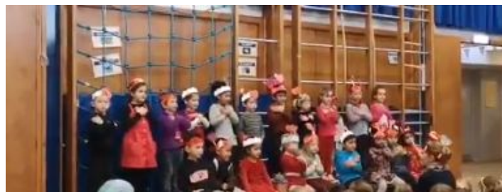
Just about the loveliest thing we've ever seen at Larkrise. Thank you Robin Class - You really made us smile. ♥♥♥♥♥