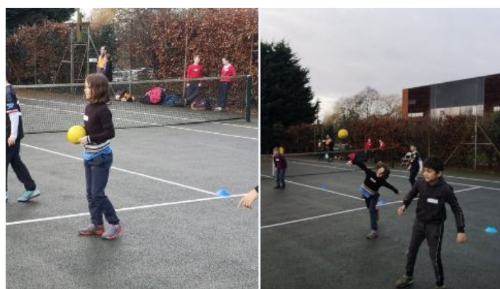
Amazing scenes at the hotly contested Dodgeball Festival. Lovely sense of fun and commitment from the children. Well done Magpie Class.

Don't forget to look out for our new celebration Magazine that will be out on Monday 9th March.